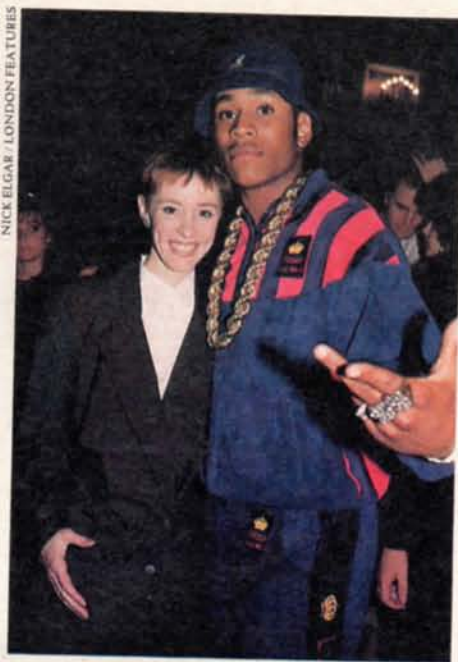
Vega and L.L. Cool J at the Beacon