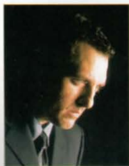
volume XII, number 1 october 1999 TOM SIZEMORE

black fedora, hollywood pattern; black cotton shirt; armari at neiman marcus, beverly hills