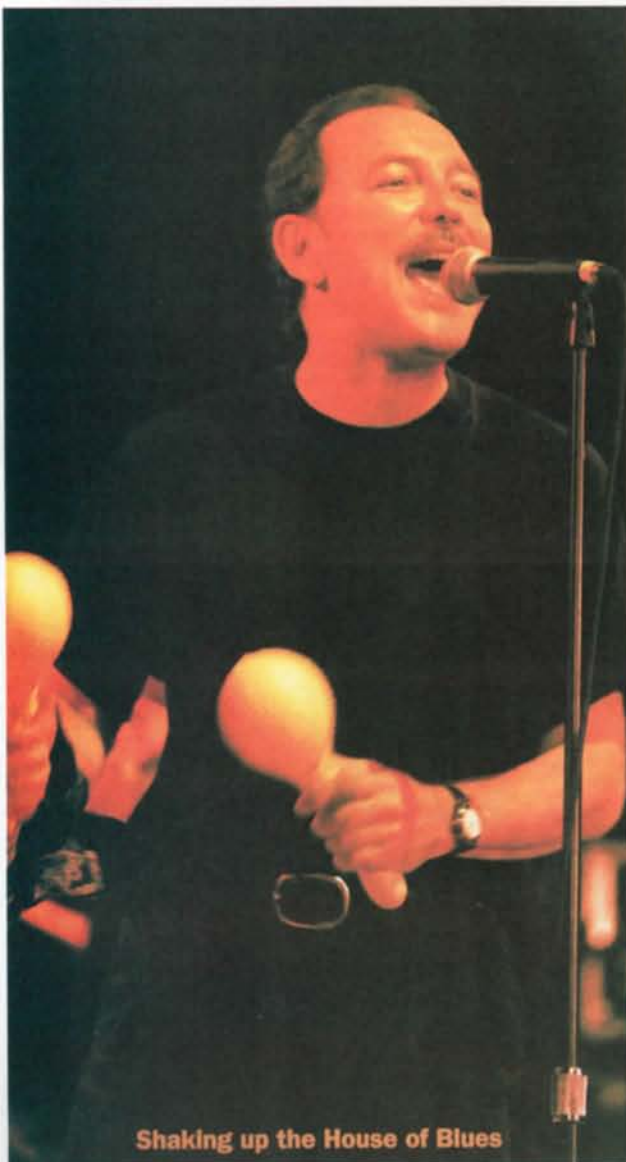
Shaking up the House of Blues

I was about to leave for Europe to begin my tour and I settled for a role that didn't take too long for me to shoot. I play the father of Penelope Cruz. Matt Damon is involved and Henry Thomas, too. It was wonderful. I really like and admire Billy Bob's work. I think he's very talented.