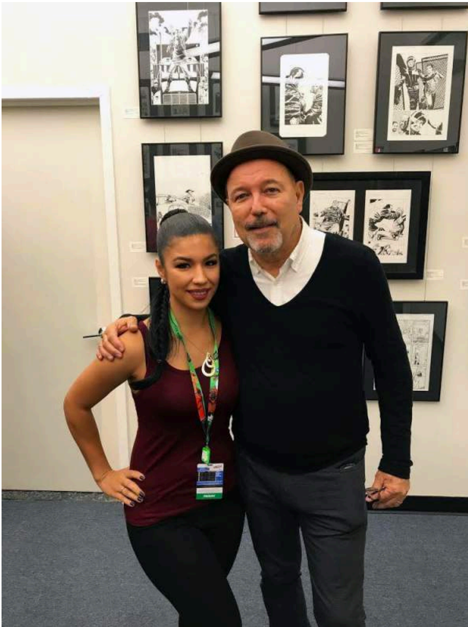
RUBEN BLADE AT METROPOLIS COLLECTIBLES

Thanks to Metropolis Collectibles for connecting me with Rubén! Metropolis is the first call celebrities and serious collectors make when building their comic collections.